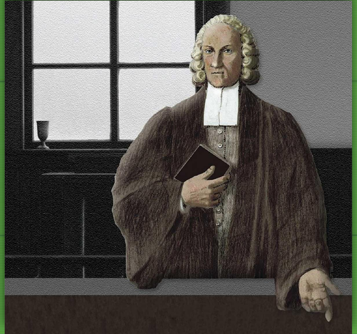
Jonathan Edwards 5 Oct 1703 — 22 Mar 1758

“Assurance is never to be enjoyed on the basis of a past experience. There is need of the present and continuing work of the Holy Spirit ... in giving assurance.”