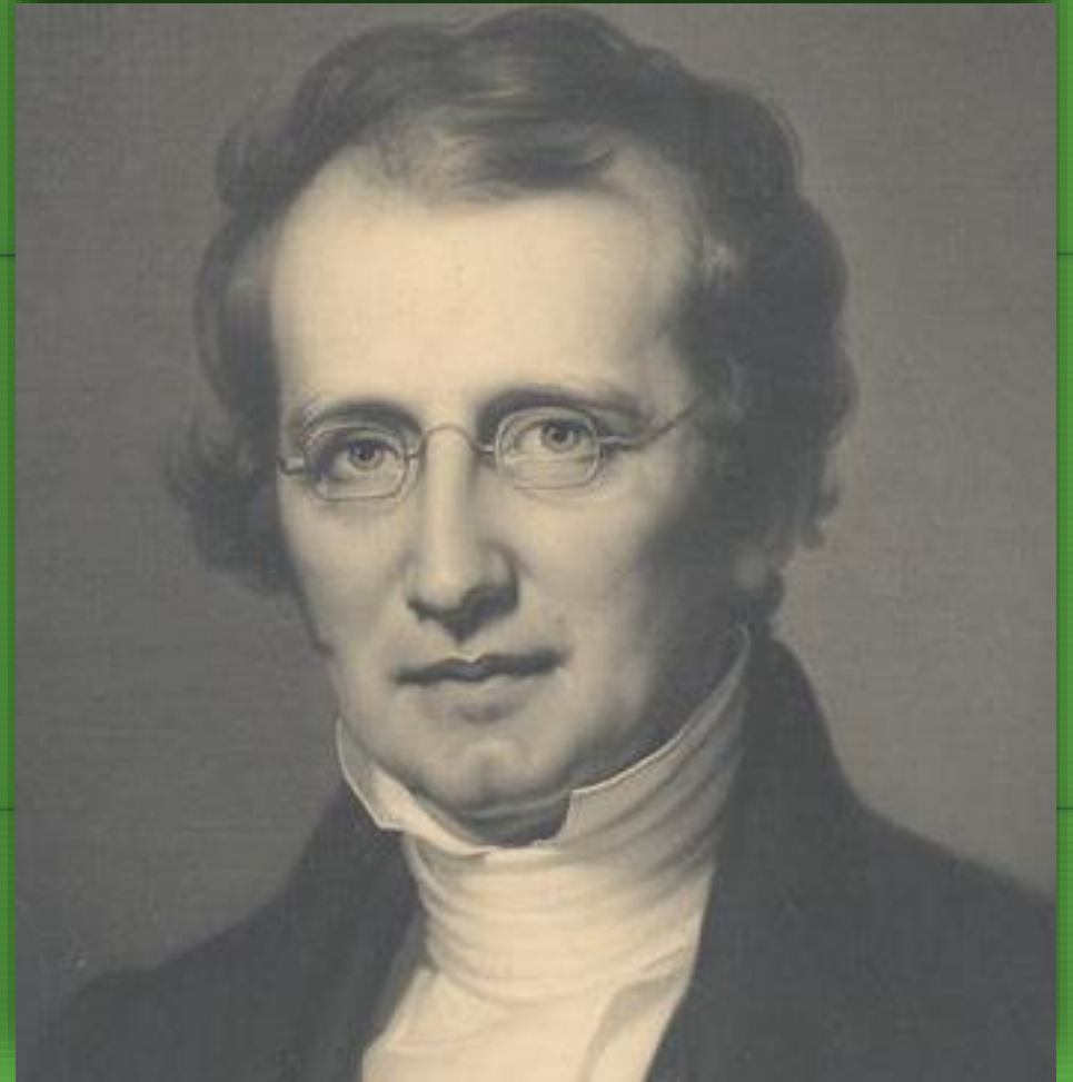
Charles Hodge 27 Dec 1797 - 19 Jun 1878

“As far as we are concerned, redemption is in order to produce holiness. We are delivered from the law, that we may be united to Christ; and we are united to Christ, that we may bring forth fruit unto God.