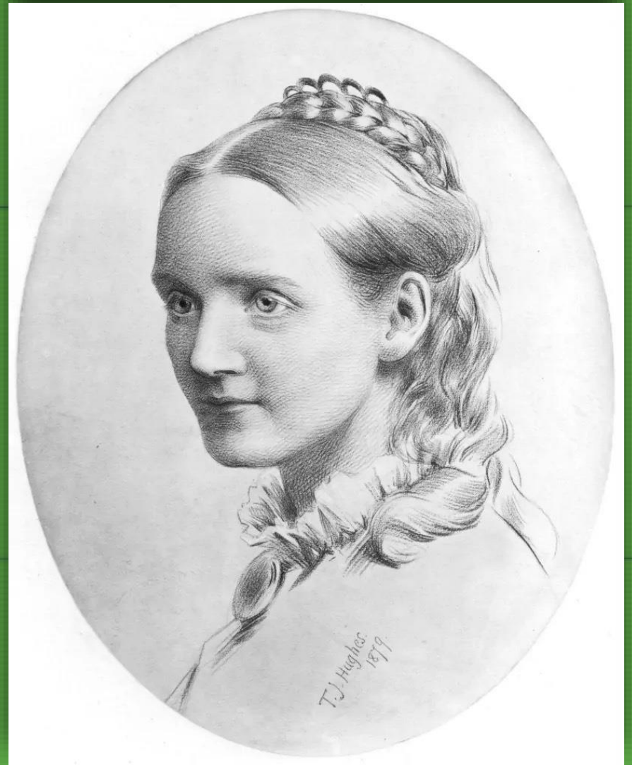
Frances Ridley Havergal

“The Lord has shown me another little step, and, of course, I have taken it with extreme delight. 'Take my silver and my gold' now means shipping off all my ornaments to the church Missionary House...”