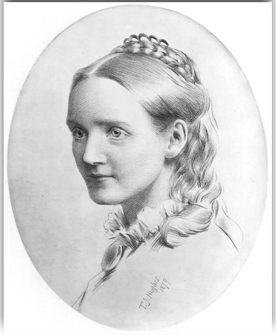
Frances Ridley Havergal