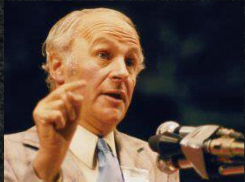
John Stott The Message of Ephesians

“The N.T. concept of the pastor is not a person who jealousy guards all ministry in his own hands, and successfully squashes all lay initiatives, but of one who helps and encourages all God’s people to discover, develop and exercise their gifts...he actually multiplies ministries.”