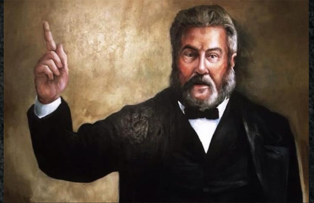
Charles Spurgeon, Morning and Evening

“There will be no doubt about His having chosen you, when you have chosen him.”