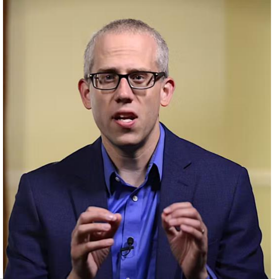
Kevin DeYoung, Taking God at His Word

“...understand enough of what must be known, believed, and observed for them to be faithful Christians.”