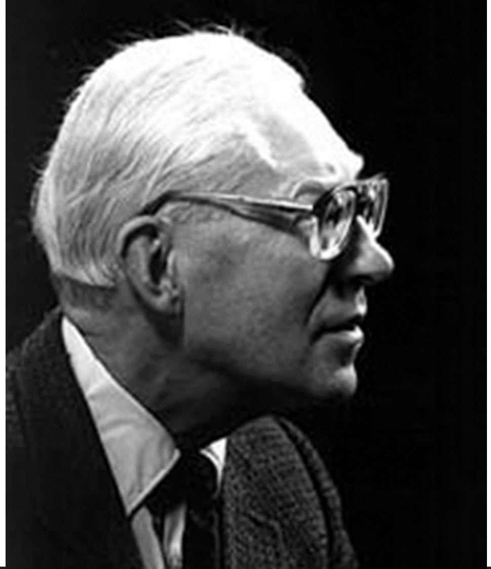
J. I. Packer, Praying

“...to God (the Father, the Son, and the Holy Spirit) in our prayers. And that is a major matter.”