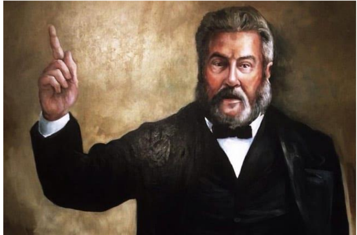
Charles Spurgeon, John Ploughman's Talks