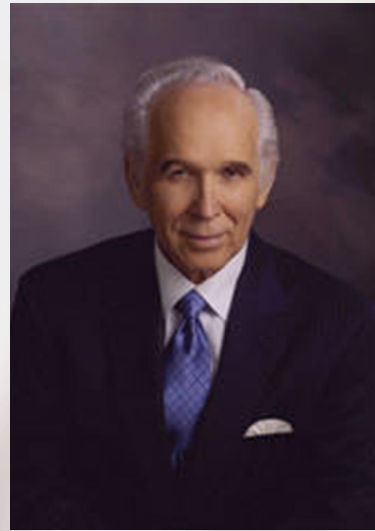
W. Phillip Keller, A Shepherd Looks at the Good Shepherd and His Sheep