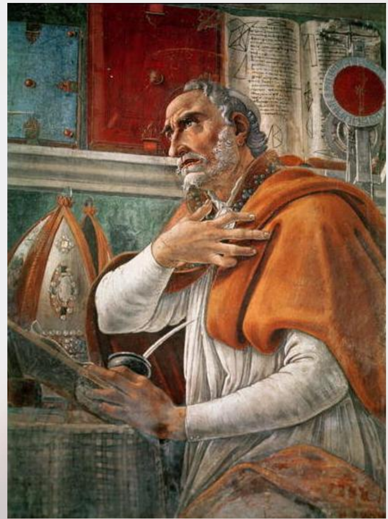
Augustine of Hippo

"You can be angry and yet serene. Your works are varied, but your purpose is one and the same. You welcome those who come to you, though you never lost them. You are never in need yet are glad to gain, never covetous yet you exact a return for your gifts ..."