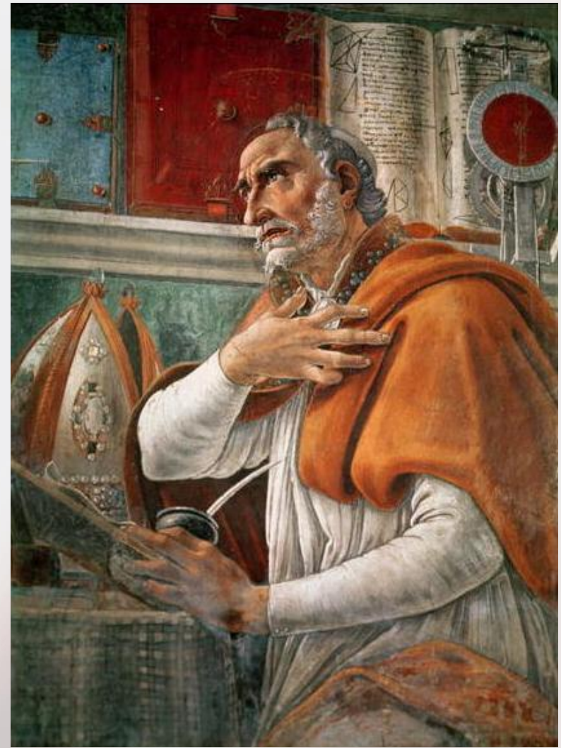
Augustine of Hippo

"...You release us from debts, but you lose nothing thereby. You are my God, my Life, my holy Delight, but is this enough to say of you? Can any man say enough when he speaks of you? Yet woe betide those who are silent about you."