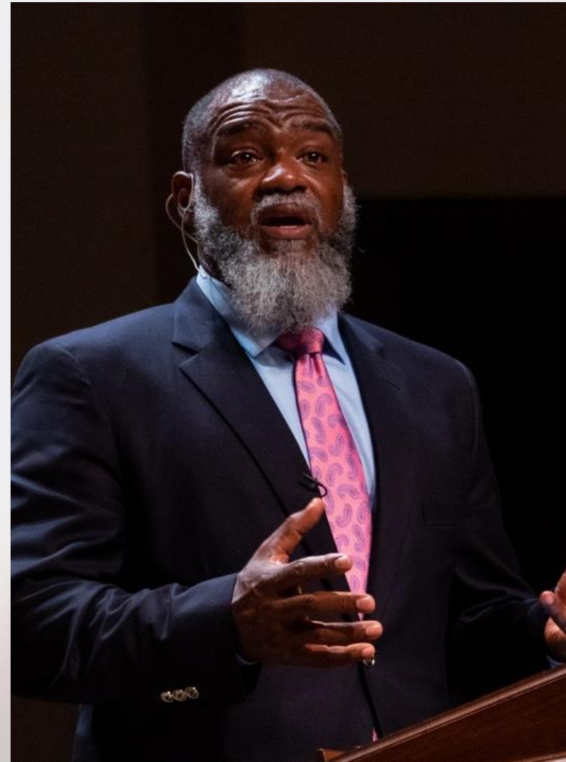
Voddie Baucham, Fault Lines

“This is not the state of white men; it is the state of all men. As such, the idea that there is a special knowledge or revelation available to some [called ethnic Gnosticism] and hidden from others by virtue of their race or position in the oppressor/oppressed scheme is unthinkable – and unbiblical.”