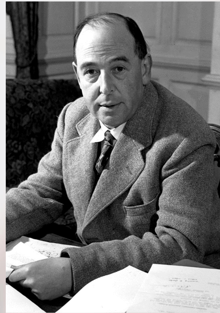
C. S. Lewis, The Last Battle

“I have come home at last! This is my real country! I belong here. This is the land I have been looking for all my life, though I never knew it till now. The reason why we loved the old Narnia is that it sometimes looked a little like this.”