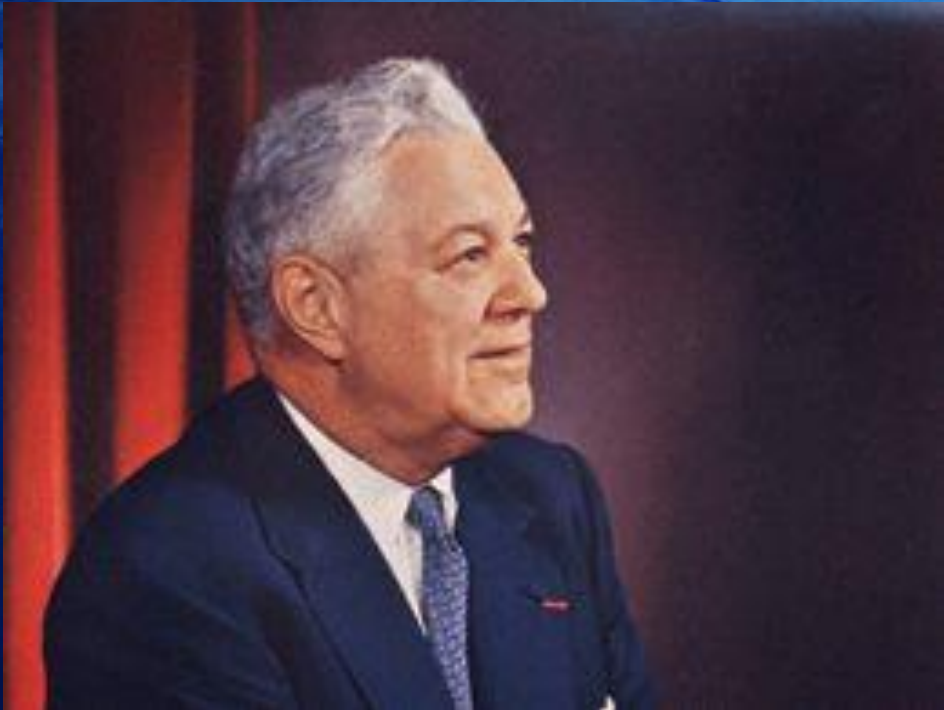
Donald Grey Barnhouse, Grace Awakening

"Love that goes upward is worship; love that goes outward is affection; love that stoops is grace."