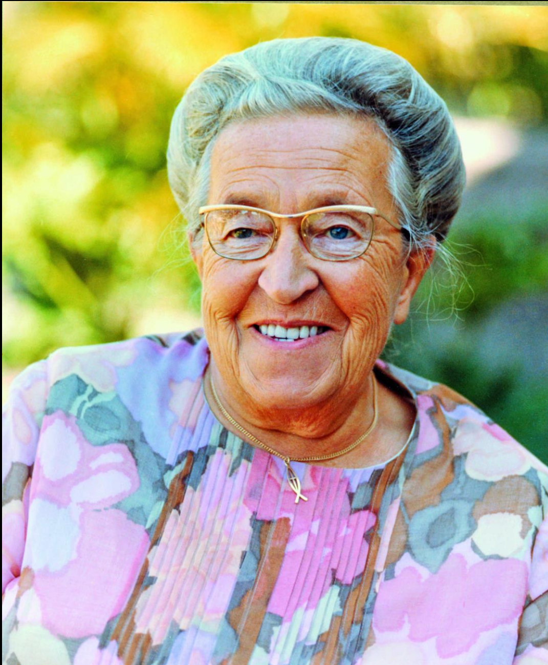
Corrie ten Boom (1892–1983), author of The Hiding Place