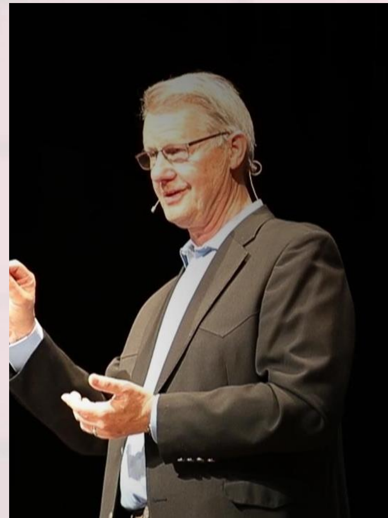
Ken Sande, The Peacemaker