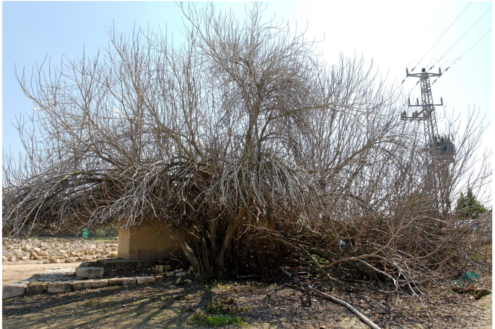
Fruitless fig Tree