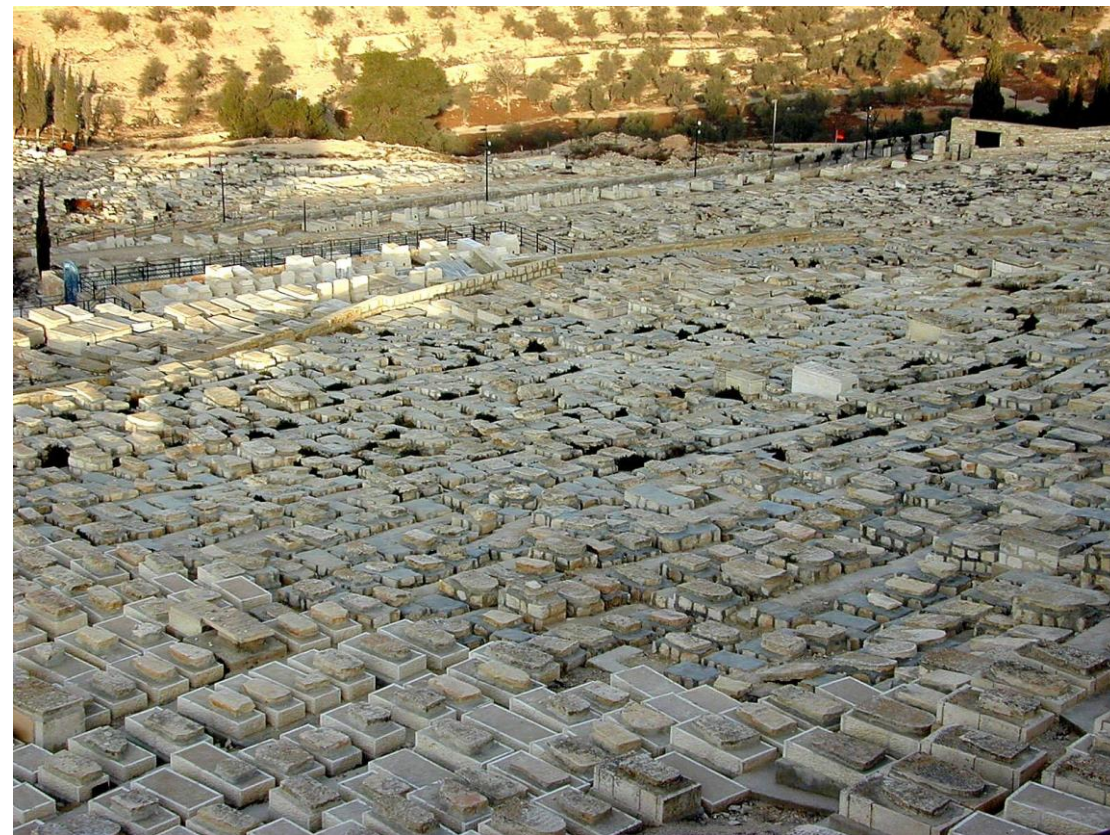
Mount of Olives