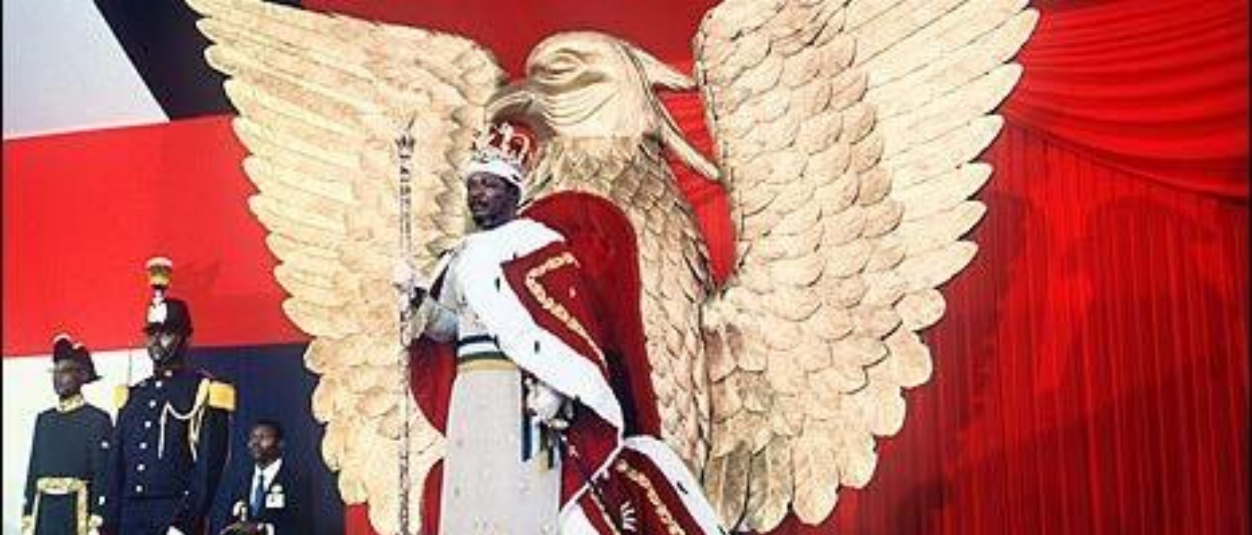
Coronation of Bokassa I, of Central African Empire (1977)